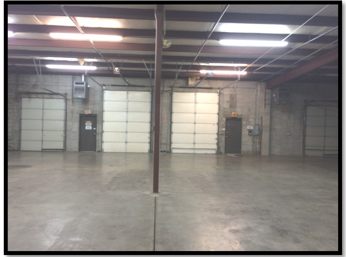
3045 A-B Warehouse