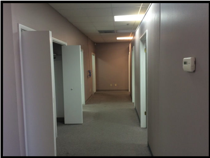
3045 A-B Offices