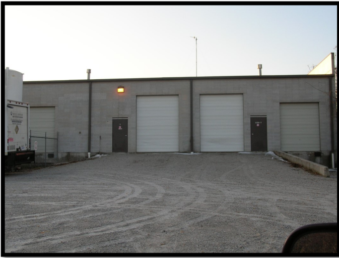
3045 A-B Dock (2) & Drive-In Doors (2)