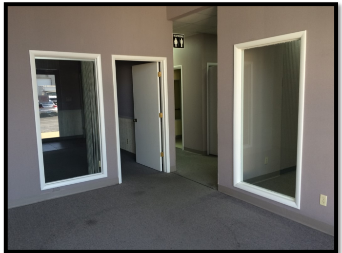
3045 A-B Offices

FOR ADDITIONAL INFORMATION PLEASE CONTACT